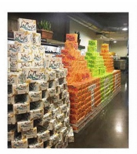
WHOLE FOODS TRIBECA, NYC