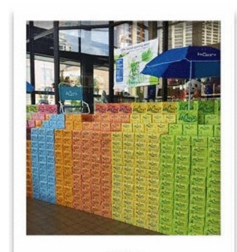
JEWEL CHICAGO, IL

Fun, Flavor and Vitality . . . the National Beverage Way