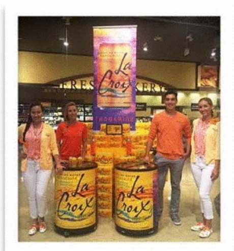
PAVILIONS NEWPORT BEACH, CA