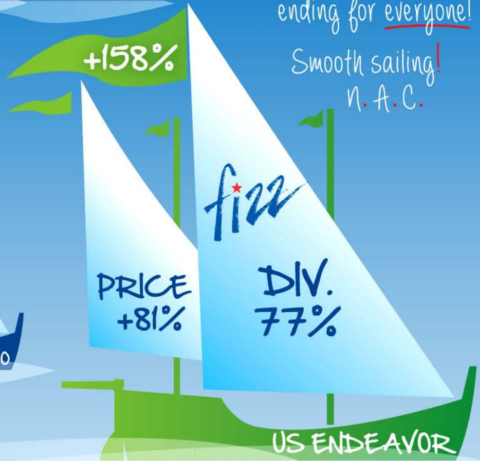
5 YEAR YIELD & APPRECIATION COMPARISONS