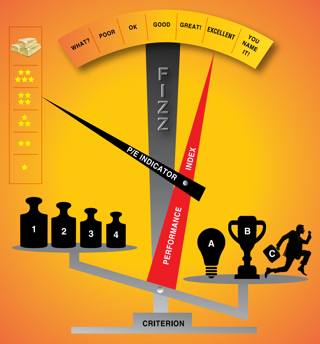
The ABC's OF VALUE